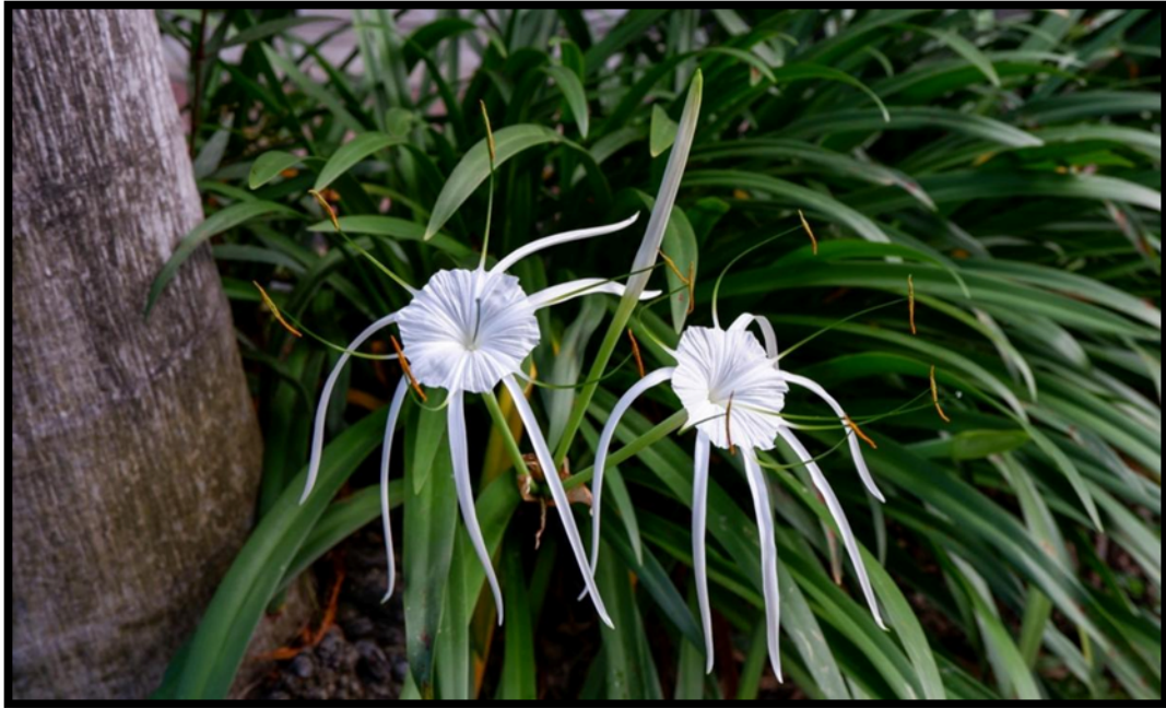
Figure 1: Hymenocallis Littoralis