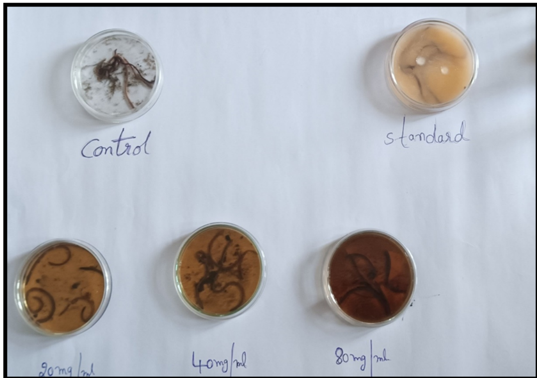
Figure 2: Anthelmintic activity carried out on the hymenocallis littoralis leaves extract